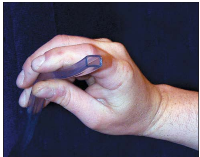
Trapezium Water Hose