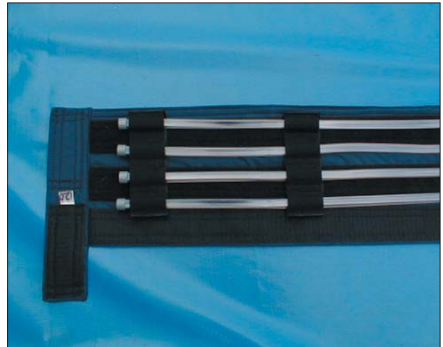
Conditioning Hose Covers

Precise Finishing Systems also has a range of manifolds to properly route the conditioned water. Additionally, we stock a wide range of quick disconnect fittings to ensure easy and efficient installation of our conditioned hose covers with your application system. Conditioned jackets can also be manufactured to fit your individual components.